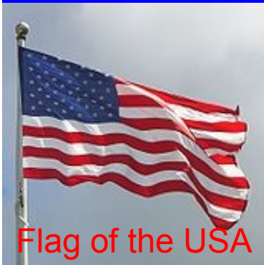
Flag of the USA