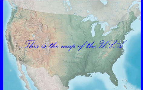
This is the map of the USA