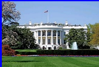
The president Lives in the White House