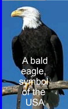
A bald eagle, symbol of the USA