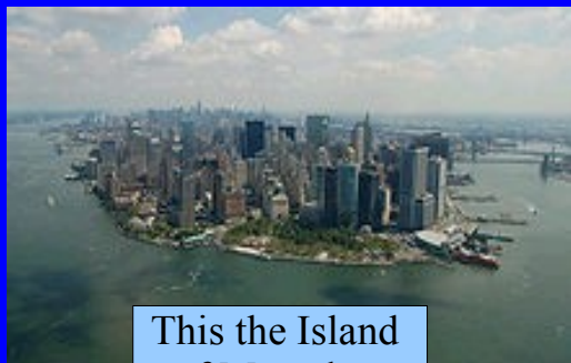
This the Island of Manathan in New York