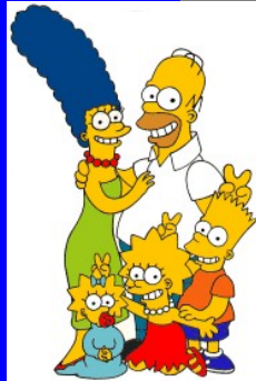
Simpson Family (american series)