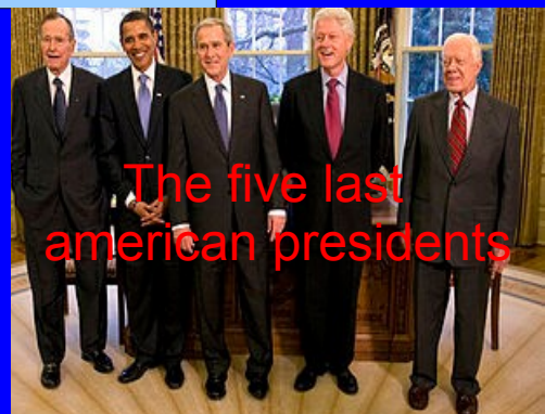
The five last american presidents